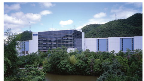
The acquired Micron fab, now TowerJazz Japan. Fab 4