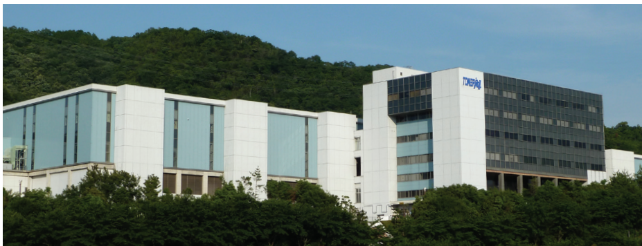
TowerJazz's recently acquired fab in Nishiwaki, Japan.

Combined with the additional business potential in Japan, this acquisition extends our geographic reach and distribution capabilities, creating a significant opportunity for revenue enhancement and increased efficiencies in manufacturing.