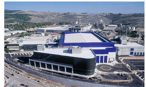
World Headquarters in Migdal Haemek, Israel Fab 1 and Fab 2

We believe that our increased manufacturing scale, expanded addressable market and superior customer service further supports TowerJazz's position as the number one specialty foundry worldwide.