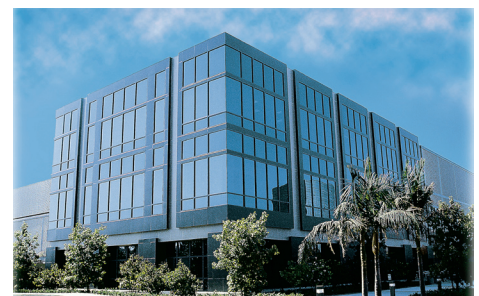
USA Subsidiary, Jazz Semiconductor, in Newport Beach, California, USA — Fab 3